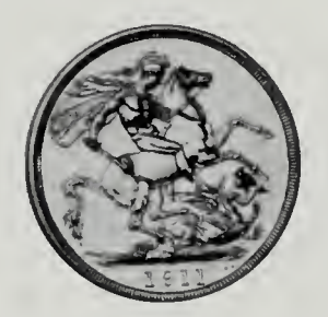
Lot No. 2916

2916 George V. Two Pounds, 1911. Obv. Plain head. Rv. St. George. S.3995. Brilliant Proof. (1,000-1,250)